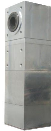
Right Angle Hollow shaft GearMotor