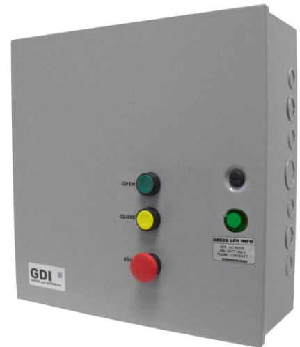
NEMA 1 Control Panel